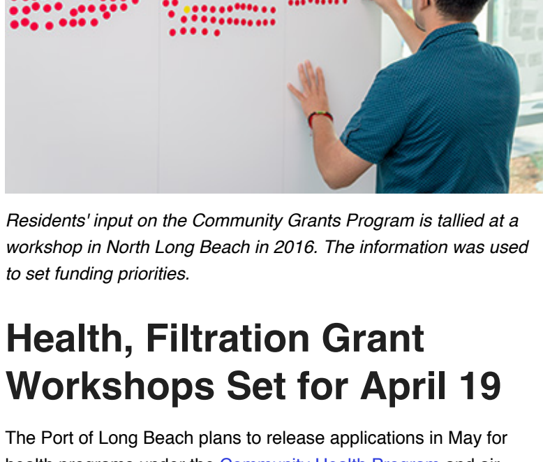
Residents' input on the Community Grants Program is tallied at a workshop in North Long Beach in 2016. The information was used to set funding priorities.

The Community Grants Program is an unprecedented effort to lessen the Port of Long Beach's impacts on the community. Over the next 12 to 15 years, we plan to invest $46.4 million toward community-based projects that reduce our impacts on air quality, traffic, noise, and water quality. For more information, visit polb.com/grants .